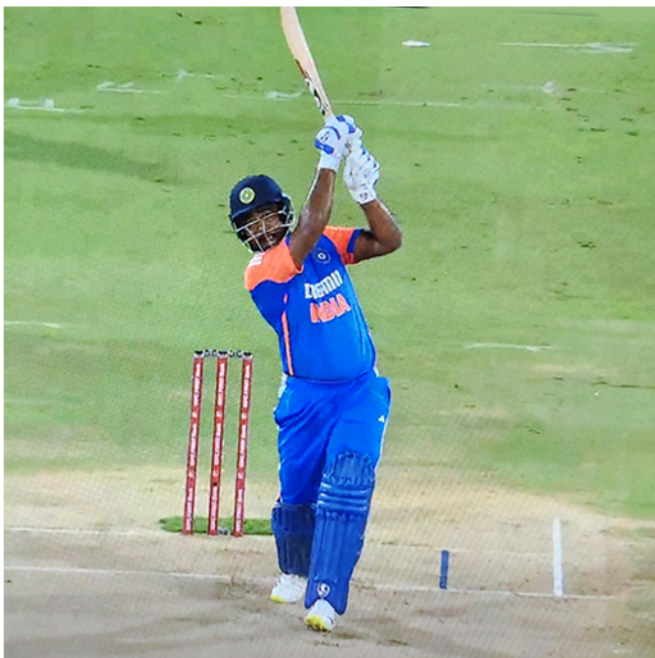
Sanju Viswanath Samson lifting the ball for a 6 at long-on on his way to 111 a first T20I century by an Indian Batsman.