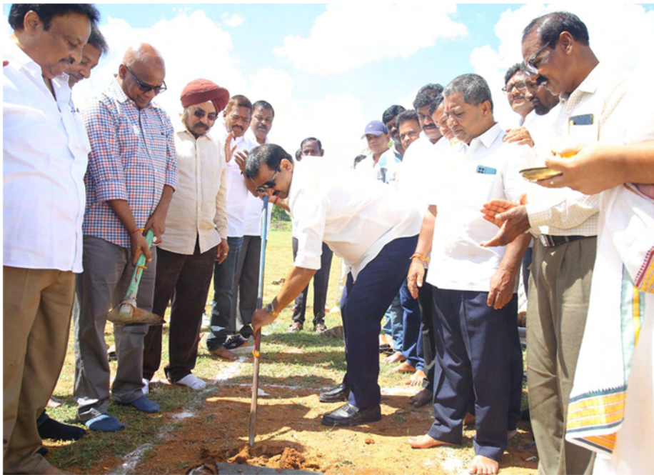
HCA President breaking the ground for laying of the Turf Wicket at Mahbubnagar in presence all members of the Apex Council.

In their quest to develop cricket at district level, the Apex Council took the first initiative in this direction by breaking the ground and laying the foundation of turf wicket at Mahbubnagar district with a financial outlay of Rs.80 Lakhs. The larger quest of the Apex Council is to lay turf wickets in all districts along with stadia capable of hosting first class cricket matches.