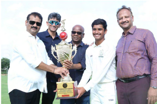
Delhi Public School - Nacharam Team Runners of HCA Under-16 Boys Schools & Junior College Tournament 2024-25.