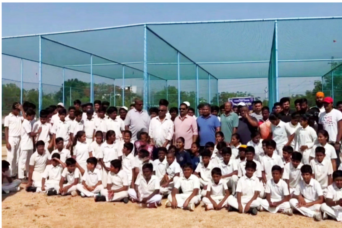
HCA Apex Council visiting Cricketers training at Summer Camps

This effort by the Apex Body of HCA will go a long way in spotting talent and nurturing the same across the state of Telangana.