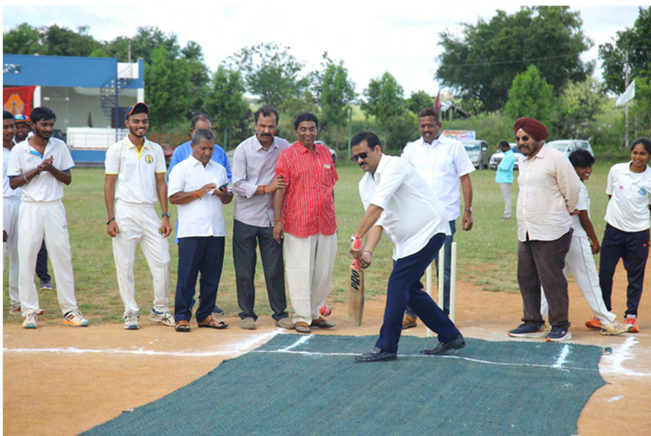
HCA President and members of the Apex Council have fun bonding with players from Mahbubnagar district.